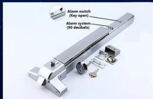
With alarm function series