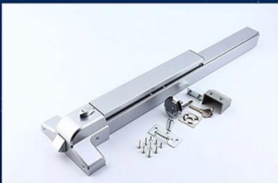
Single side door series

Stainless steel precision casting tongue, resisting strong impact. Copper lock cylinder, smooth unlocking Thick and hard paint finish, more corrosion resistant, more wear resistant 65CM-100CM length optional