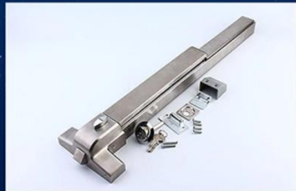
Stainless steel series