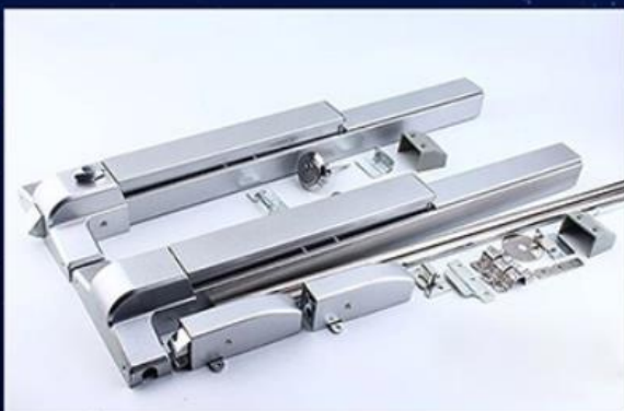
Double door series